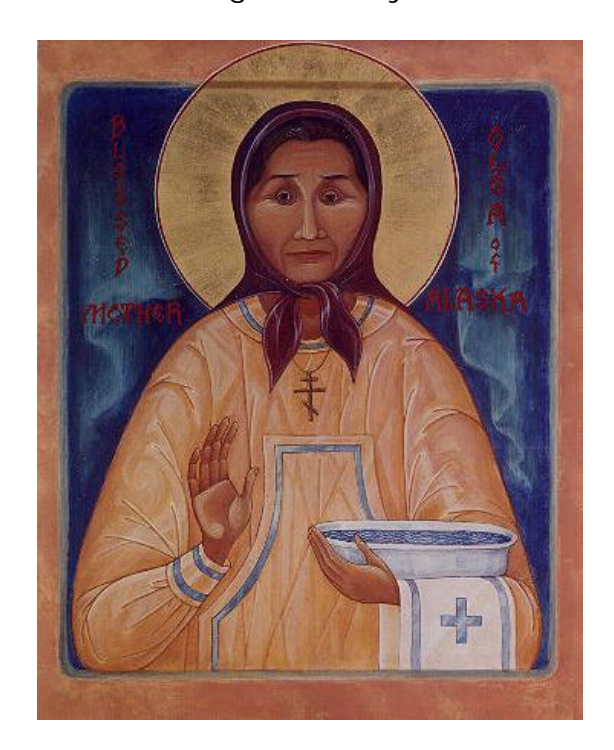
Mother Olga the Midwife Icon (written by Bess Chakravarty)